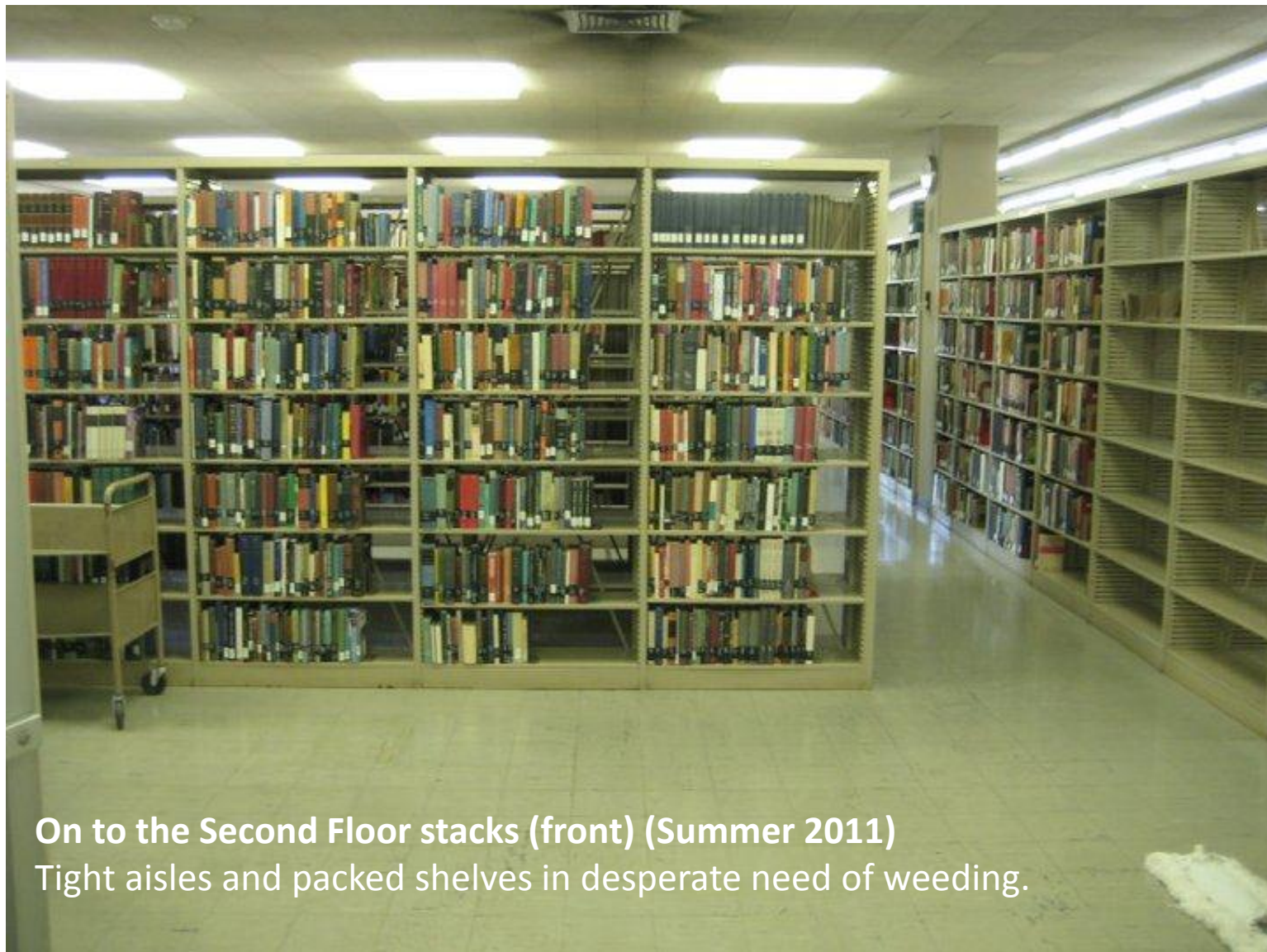
On to the Second Floor stacks (front) (Summer 2011) Tight aisles and packed shelves in desperate need of weeding.