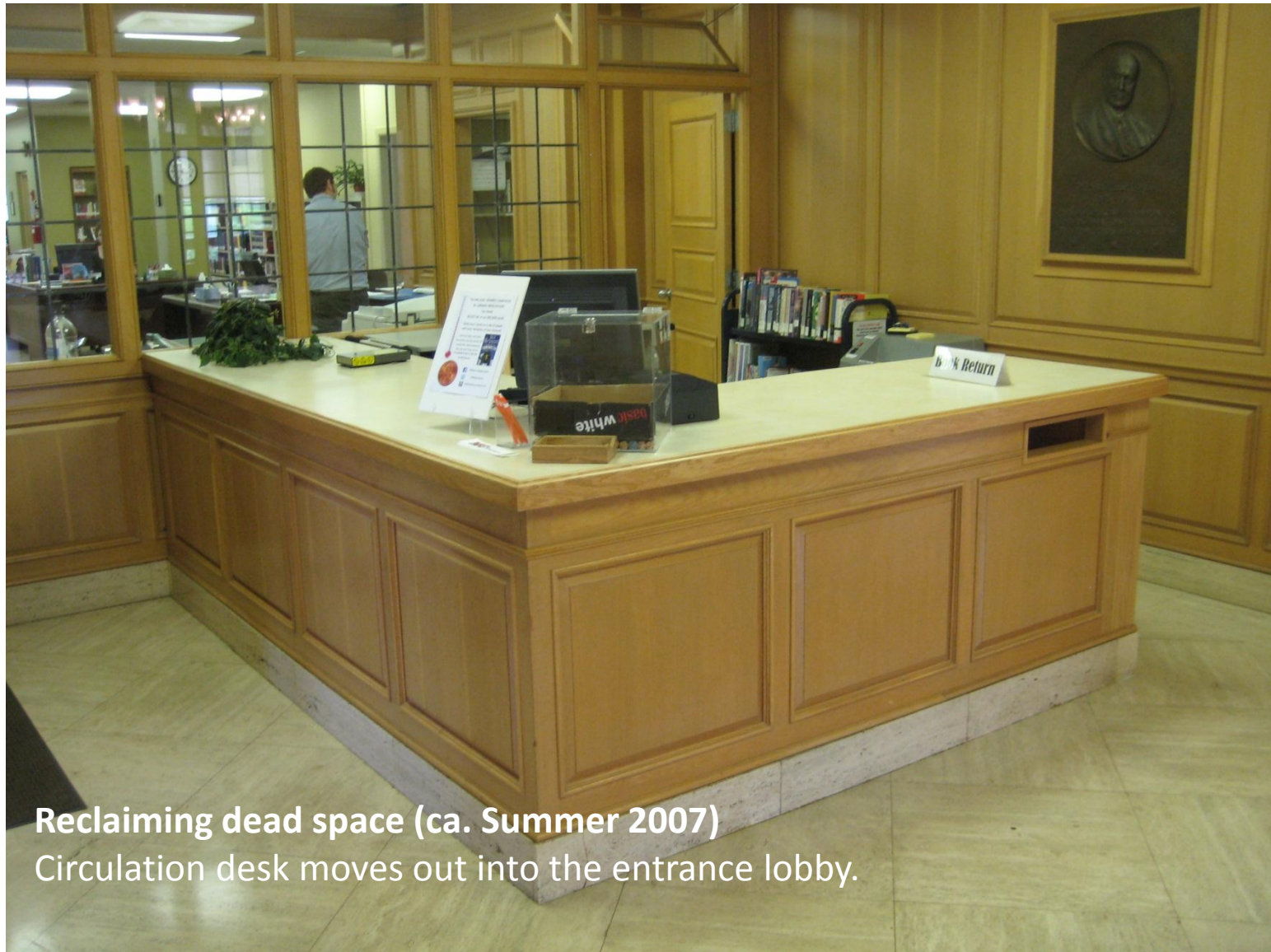
Reclaiming dead space (ca. Summer 2007) Circulation desk moves out into the entrance lobby.