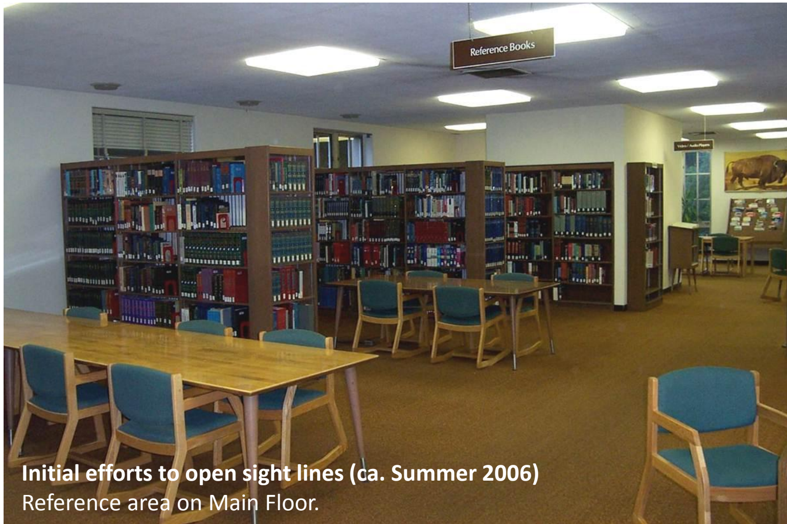
Initial efforts to open sight lines (ca. Summer 2006) Reference area on Main Floor.