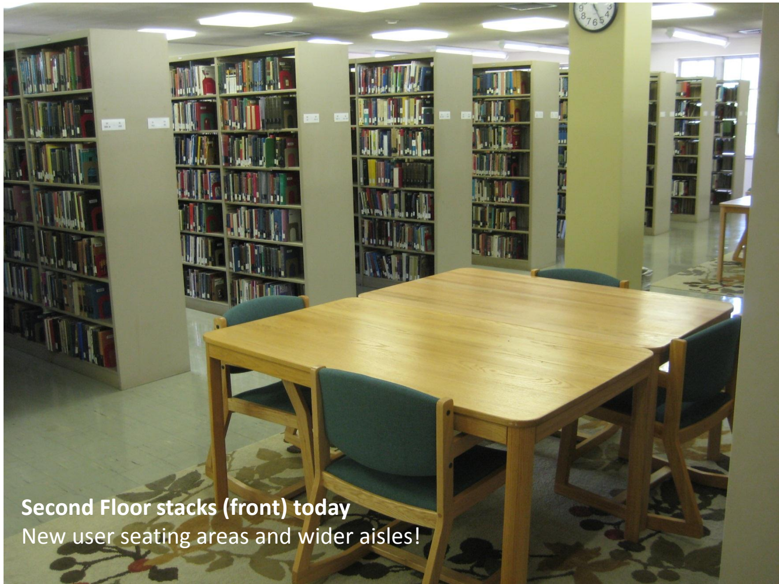
Second Floor stacks (front) today New user seating areas and wider aisles!