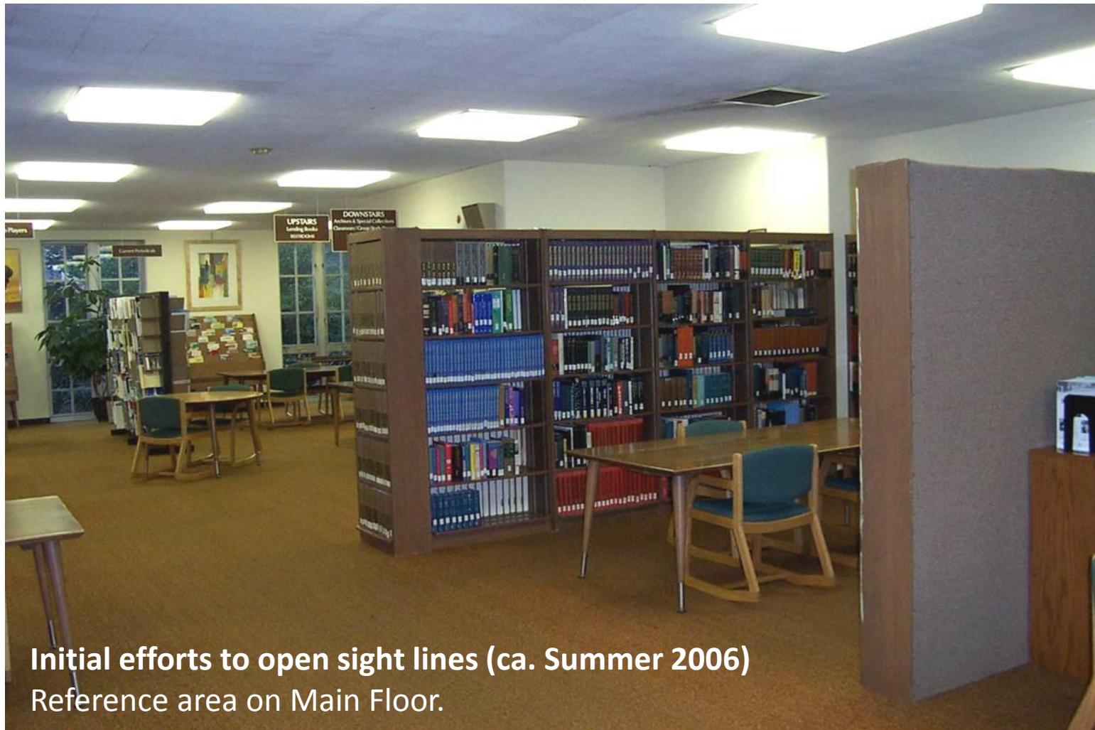
Initial efforts to open sight lines (ca. Summer 2006) Reference area on Main Floor.