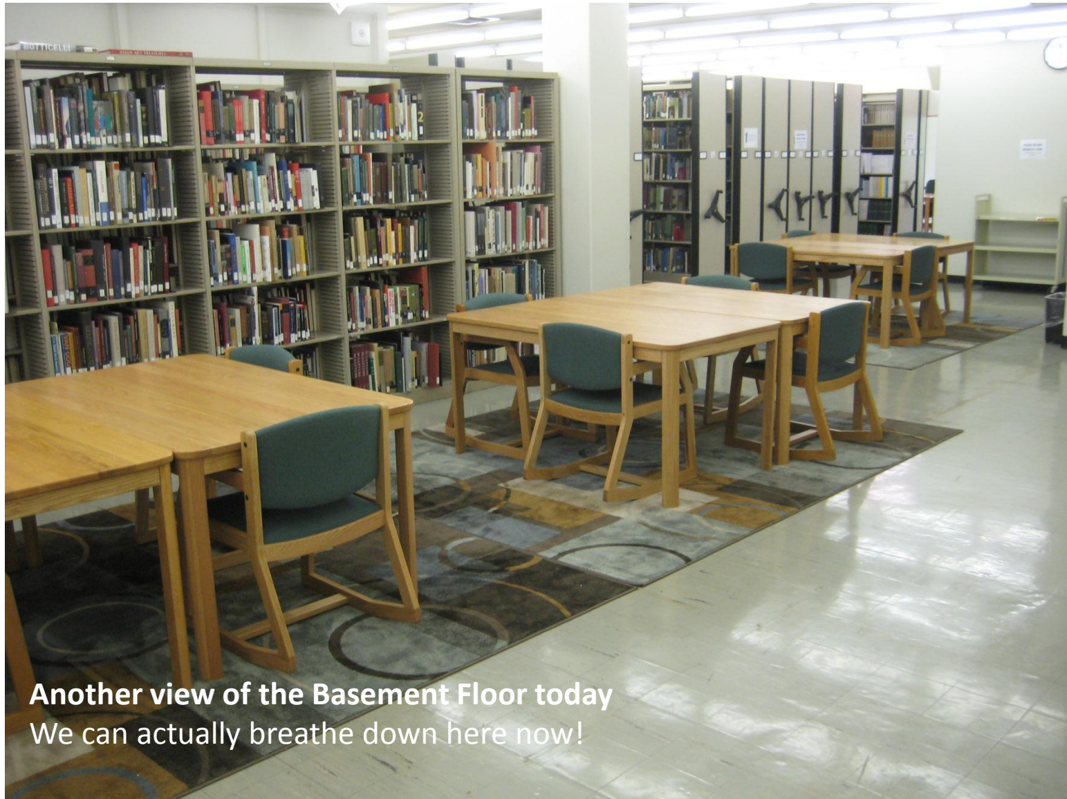
Another view of the Basement Floor today We can actually breathe down here now!