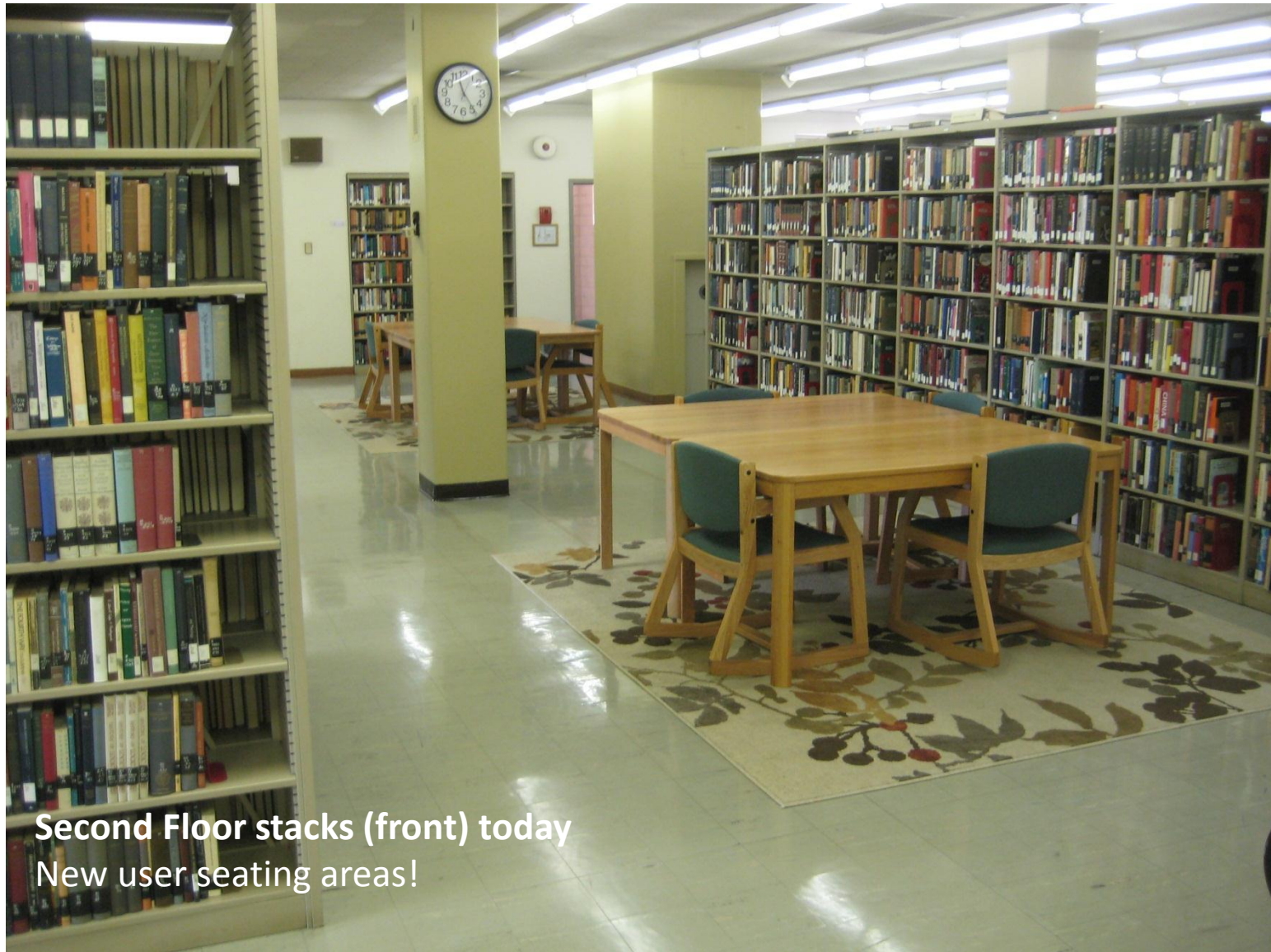
Second Floor stacks (front) today New user seating areas!