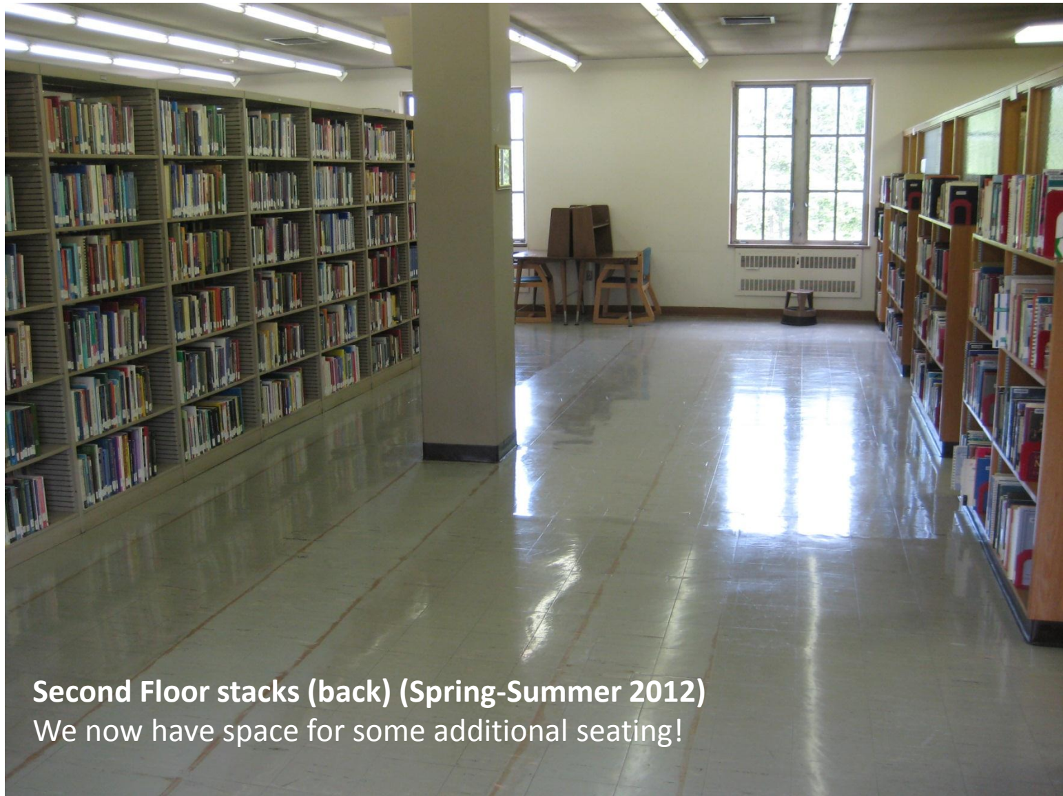
Second Floor stacks (back) (Spring-Summer 2012) We now have space for some additional seating!