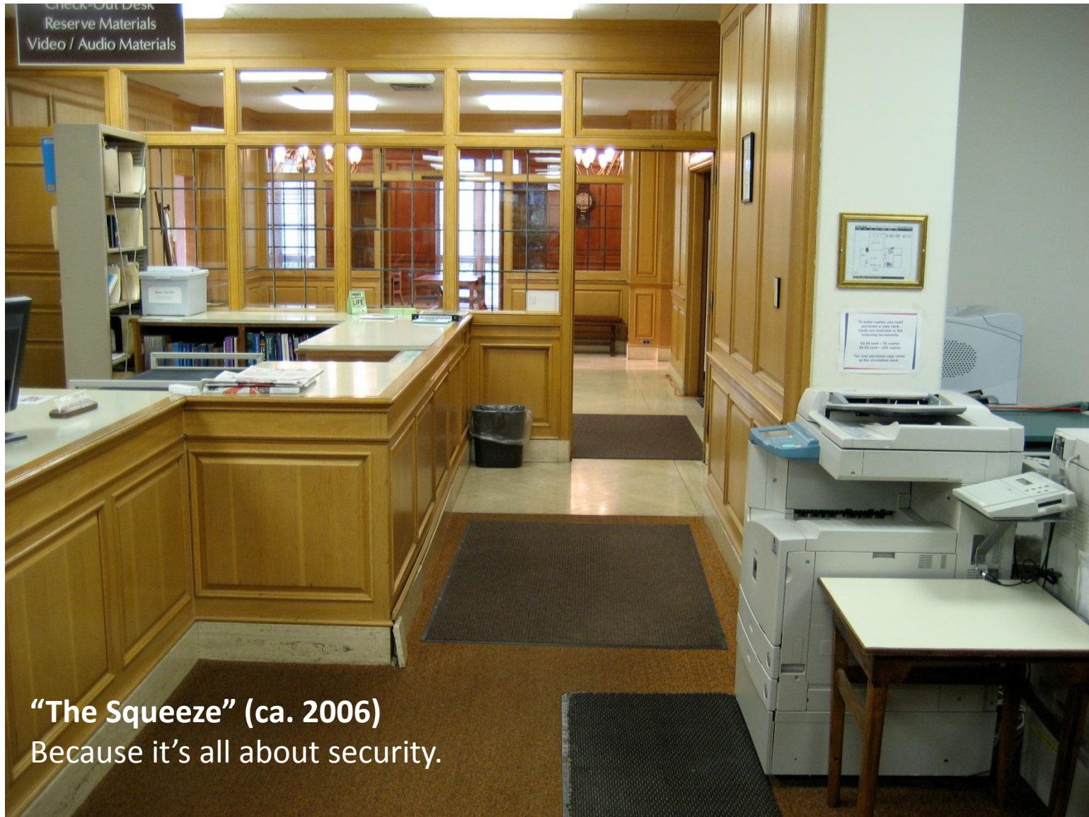
“The Squeeze” (ca. 2006) Because it’s all about security.