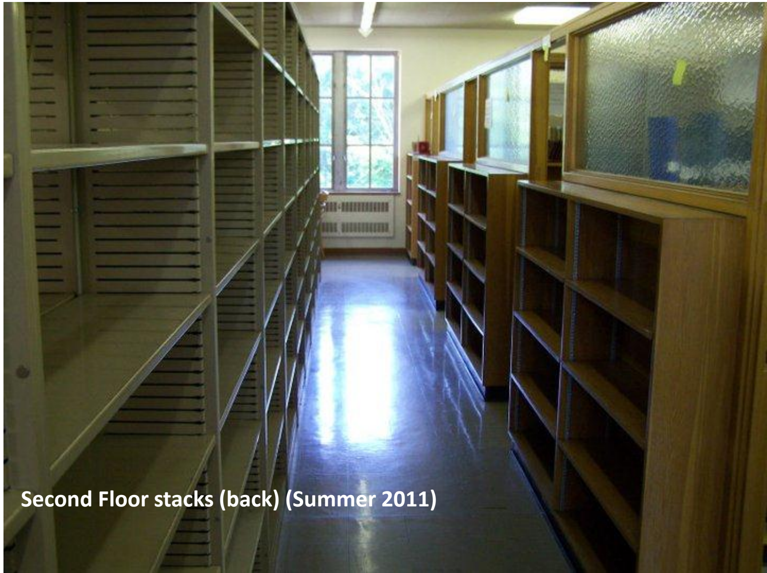
Second Floor stacks (back) (Summer 2011)