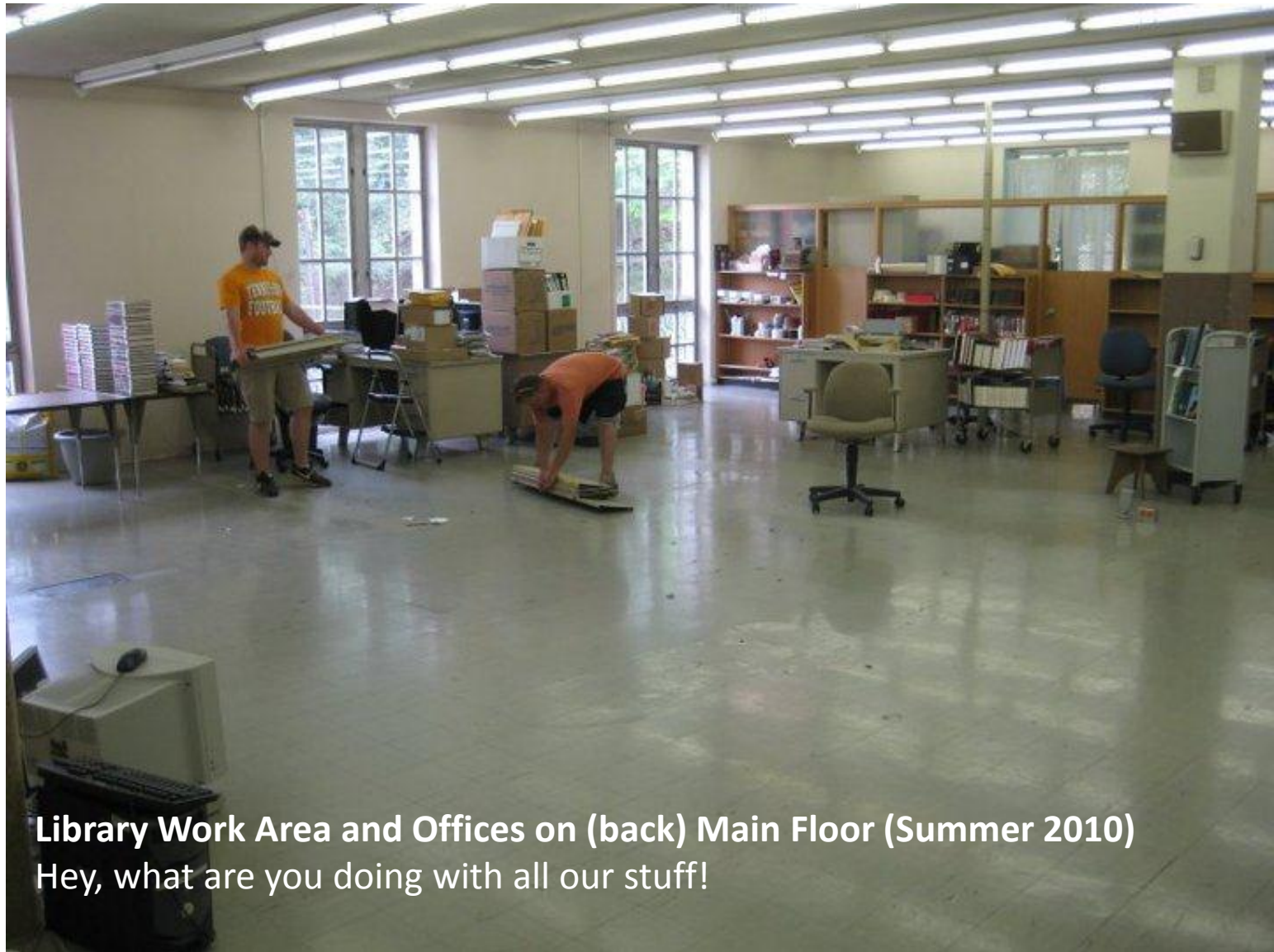
Library Work Area and Offices on (back) Main Floor (Summer 2010) Hey, what are you doing with all our stuff!