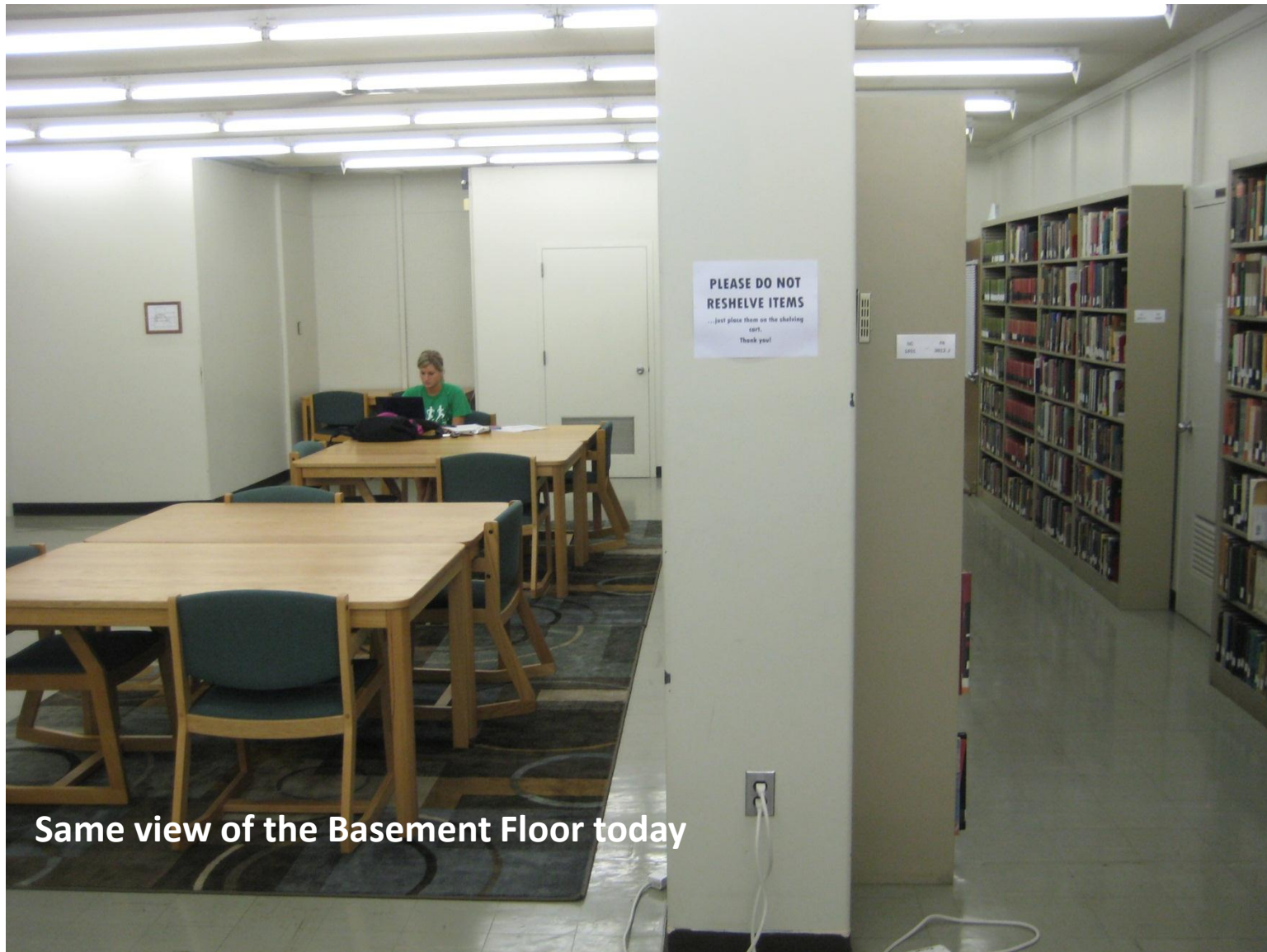
Same view of the Basement Floor today