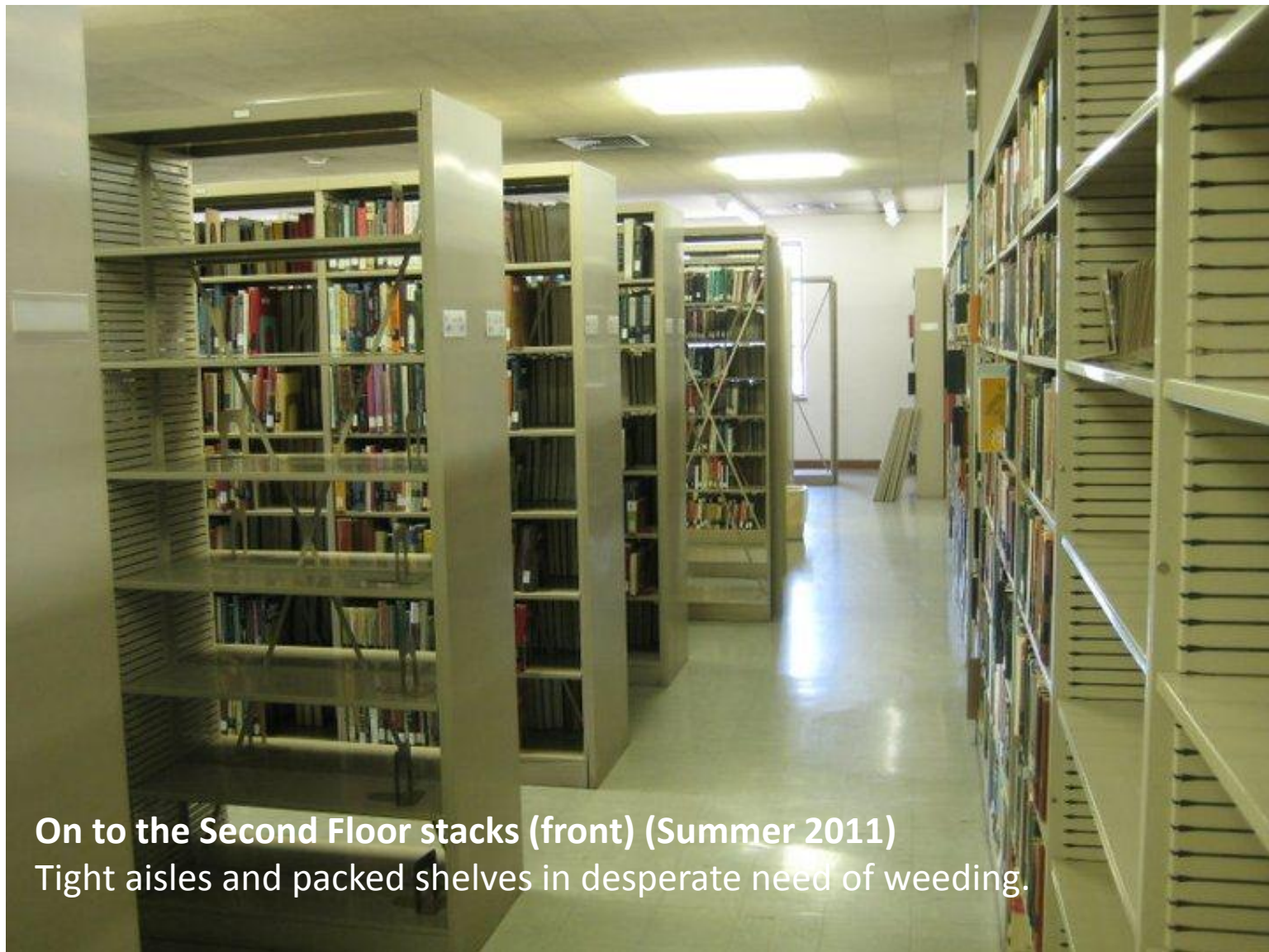
On to the Second Floor stacks (front) (Summer 2011) Tight aisles and packed shelves in desperate need of weeding.