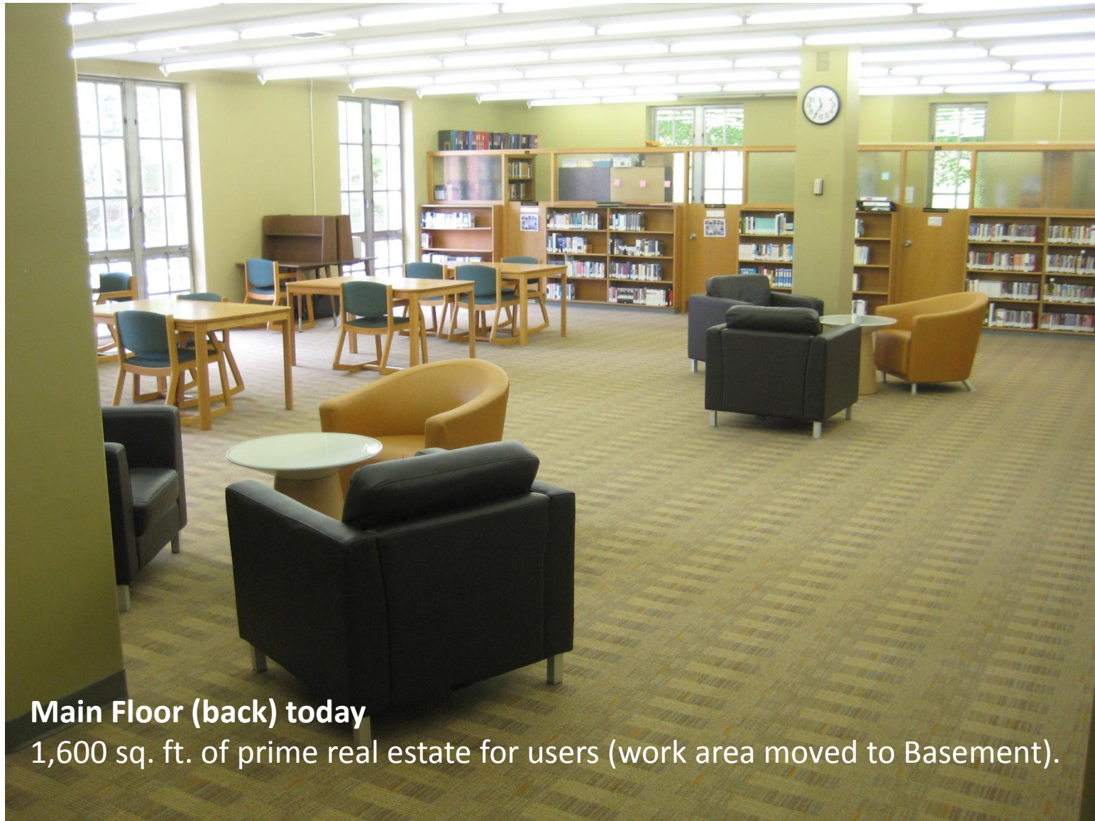
Main Floor (back) today 1,600 sq. ft. of prime real estate for users (work area moved to Basement).