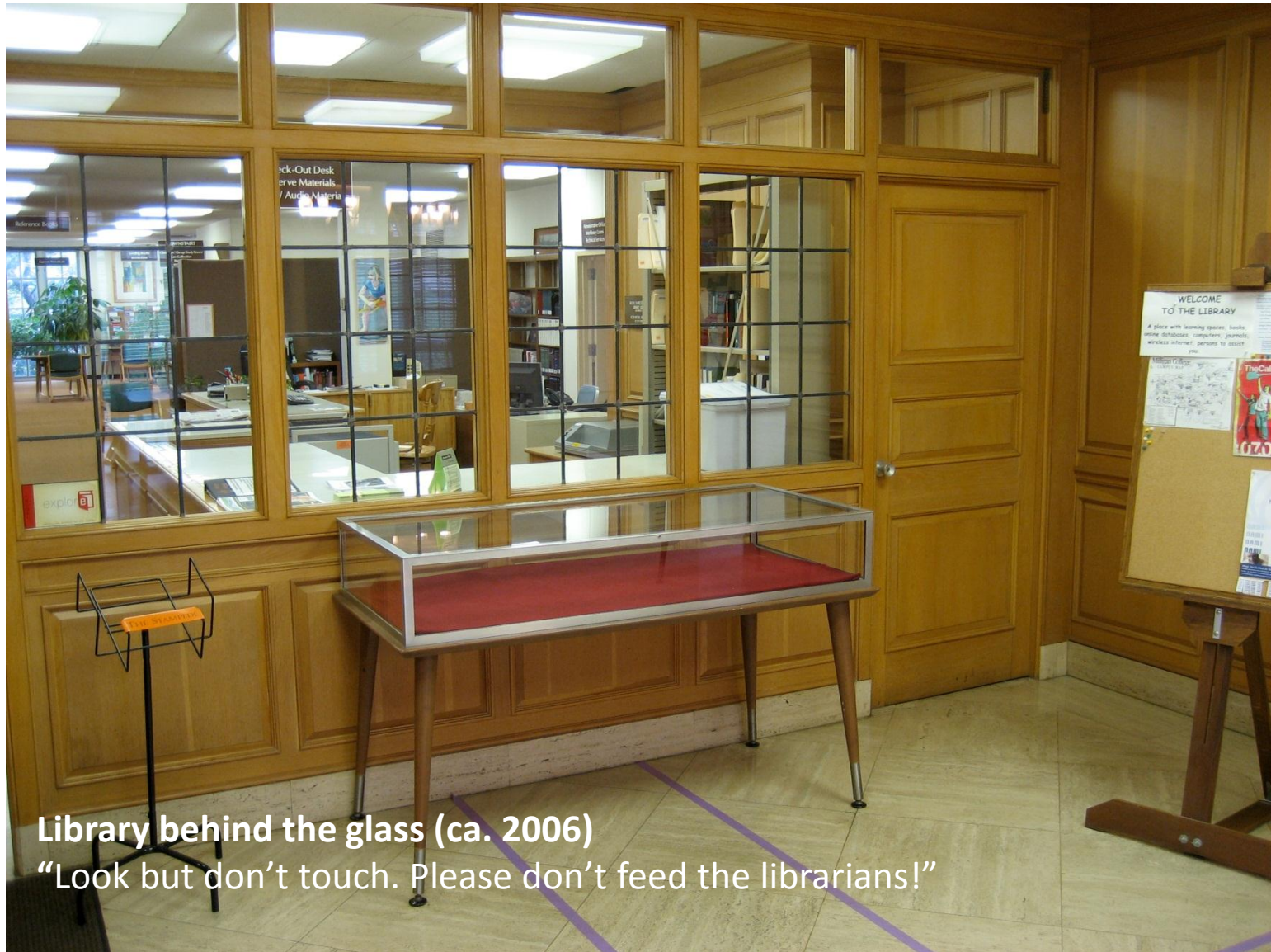
Library behind the glass (ca. 2006) “Look but don’t touch. Please don’t feed the librarians!”