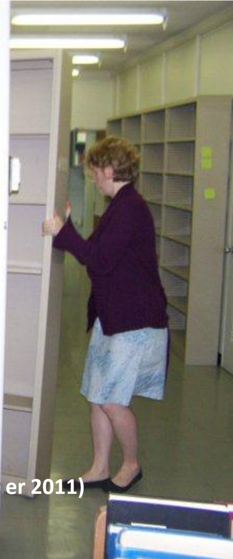
Dismantling the Basement Floor "Labyrinth" (Summer 2011)