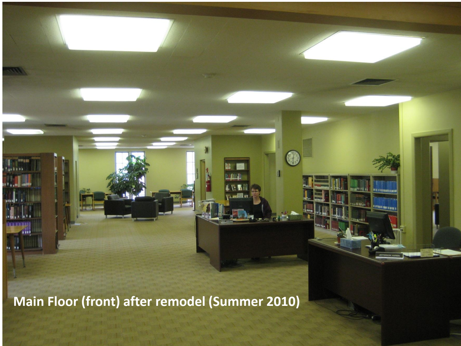
Main Floor (front) after remodel (Summer 2010)